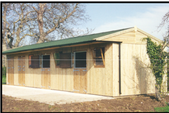
Block of three Stables with Tool Store on end.