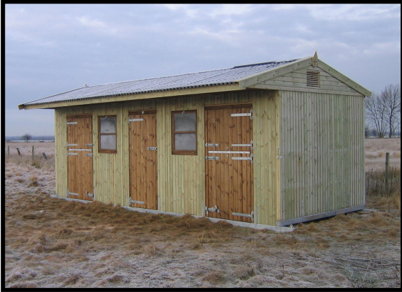
Dual Stable with centre Tack Room on Skids.