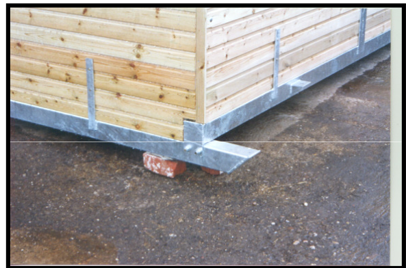
Illustration of skids.