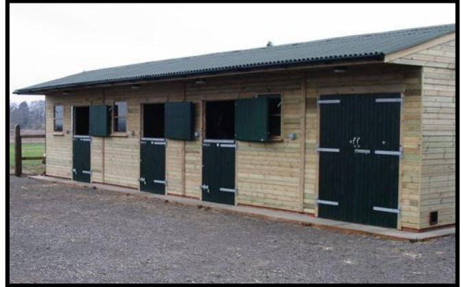
Block of three Stables with Tack Room on end.